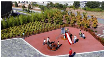
View from one of the roofs to the playground.