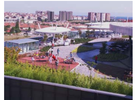
The green roof of the Marmara Forum Shopping Mall & Offices with the different species.

ducts. It provides also a nice atmosphere with different species of plants and with the view of the Marmara Sea. In Garden Offices (2500 m 2 ), all offices open out onto the several verdant courtyards, applied with the green roof concept. There are also two outside terraces in front of the offices. The project aims with its huge green roof area, to provide natural surroundings for the shopping mall visitors and the office occupants, as the green areas in the region were mostly replaced by concrete buildings and motorways because of the dense housing and population.