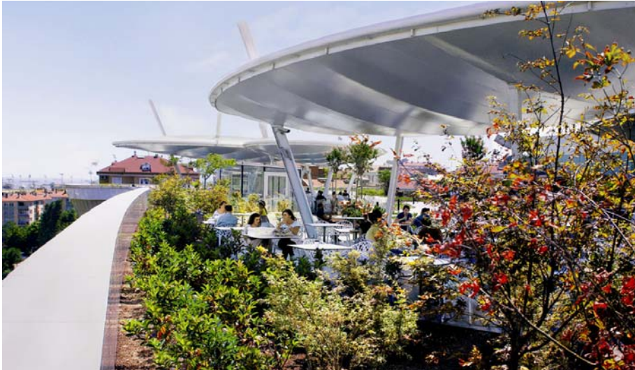
The green roof offers a natural atmosphere for the city residents, which is hard to find in the neighbourhood.