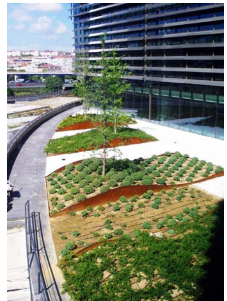
Courtyards of the offices built with the green roof concept.