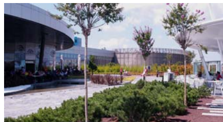
A mixed use with pedestrian ways, outdoor seating, playgrounds and ponds.